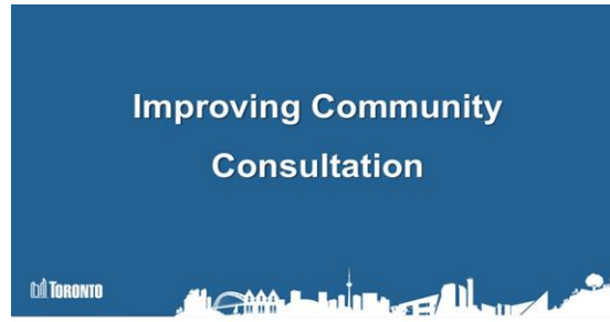
Providing feedback to the City on improving community consultations