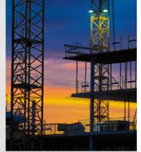
Mimico community development survey