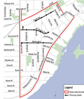
Mimico Neighbourhood Mobility Plan public consultations