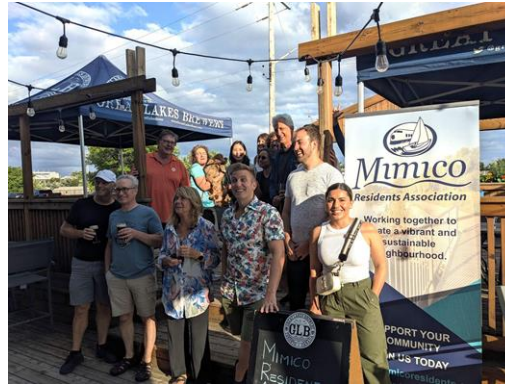
July 2023: Summer Get Together at Great Lakes Brewery