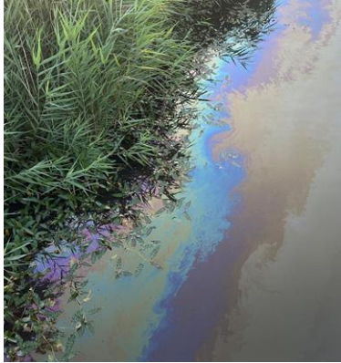
Advocacy on your behalf re: Mimico Creek spill