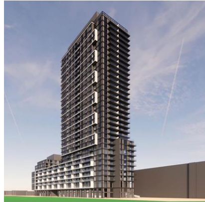
Raising community concerns re: proposed development at 2405-2411 Lakeshore Blvd W