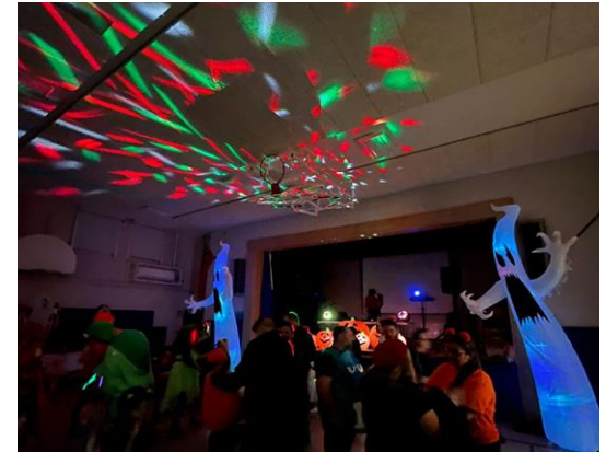
October 2023: Halloween Dance