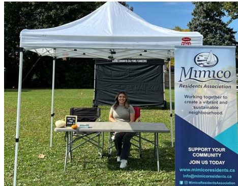
October 2023: Fall Fest