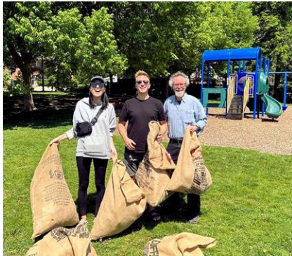
May 2023: Clean-Up Day at Mimico Parks