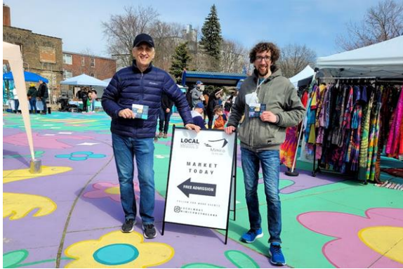
April - August 2023: Local MRKT