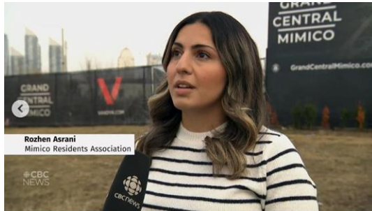
Speaking out on the Mimico Go station / Vandyk receivership issue